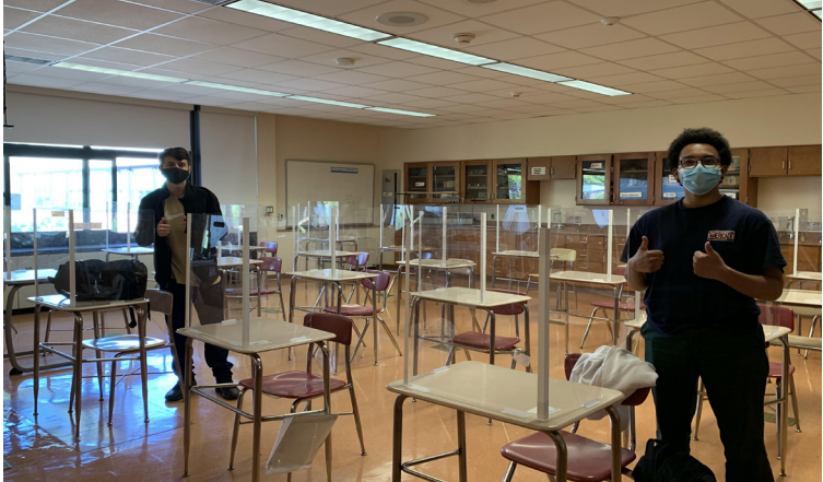
The junior physics classroom where the tension first erupted.