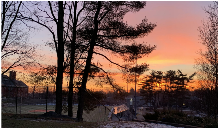
The MHS football field lit by a mindful sunrise.

Taking deep, meditative breaths as students contemplate