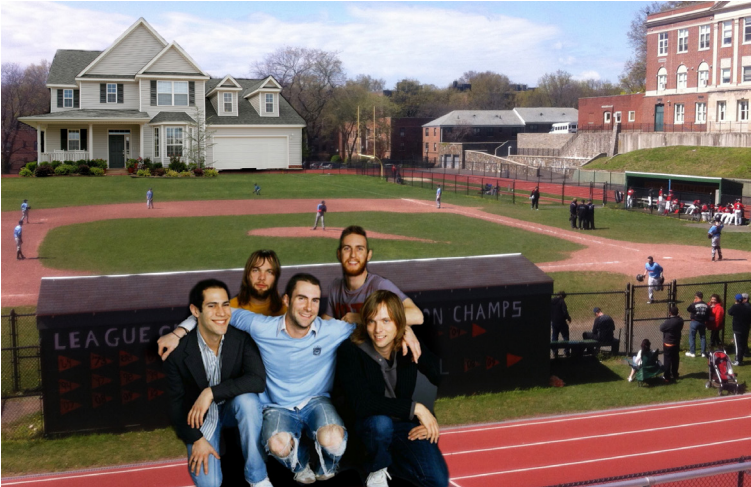
Maroon 5 poses next to their new development.

The famous band has found Mamaroneck to be an ideal spot for their next getaway.