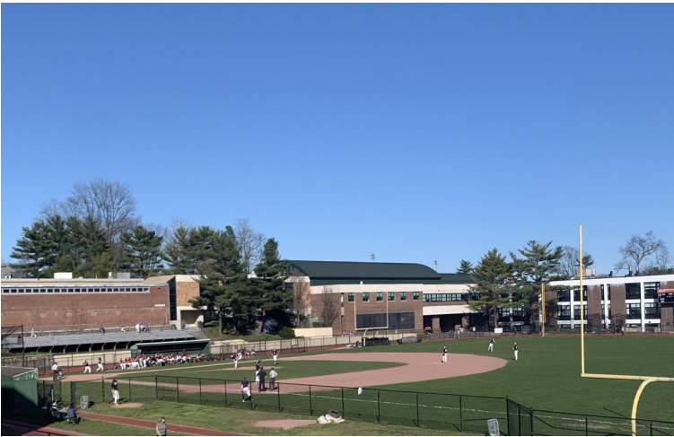
The current baseball field. Looks like there's a lot of space for a mansion.